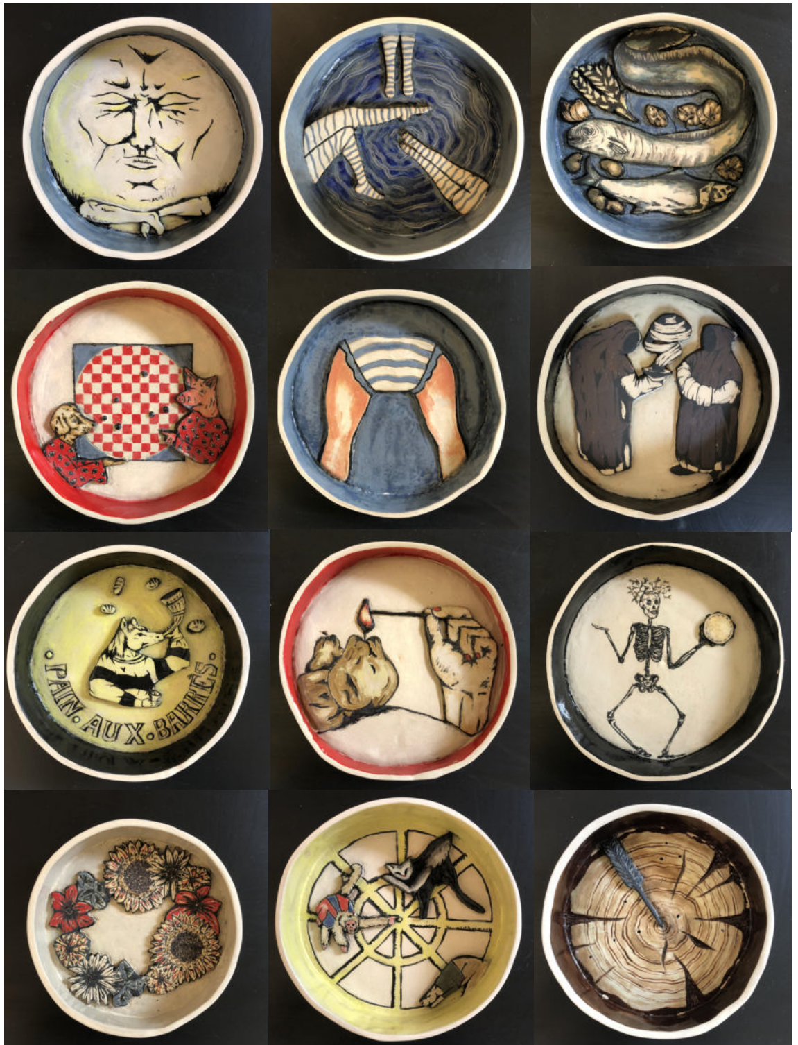
12 ceramics of 12 cm of diameter

During the lockdowns, I have been working on the adaptation of Les crieries de Paris . This multidisciplinary satirical project is inspired by Guillaume de Villeneuve's poem, dated 1265. This poem traces the sound and taste crossing of Paris in the 13th century, from dawn to night. Les crieries de Paris is above all an oral poem and is part of my recurring research on the sound archive. I rewrote this fabliau in a more contemporary version. From this text, I made 12 ceramics such as small sketches for the set of a future installation.