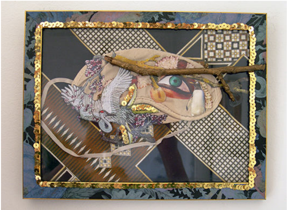
Details of the installation