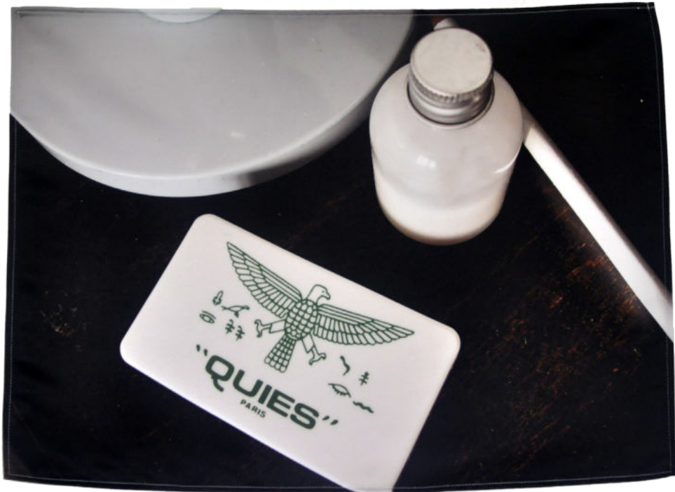
Qui est-ce ? , Paris, 2017, Photograph printed on textil, 60/45 cm