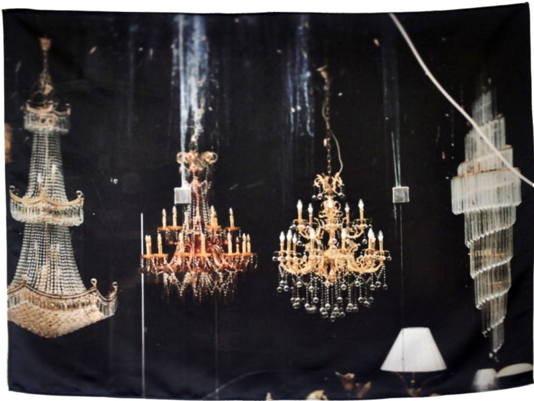
Tel-Aviv , Tel-Aviv, 2018, Photograph printed on textil, 105/80 cm