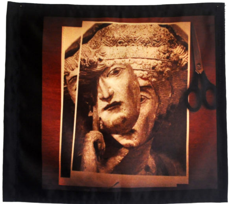
Zenobie , Paris, 2017 Photograph printed on textil 40/40cm