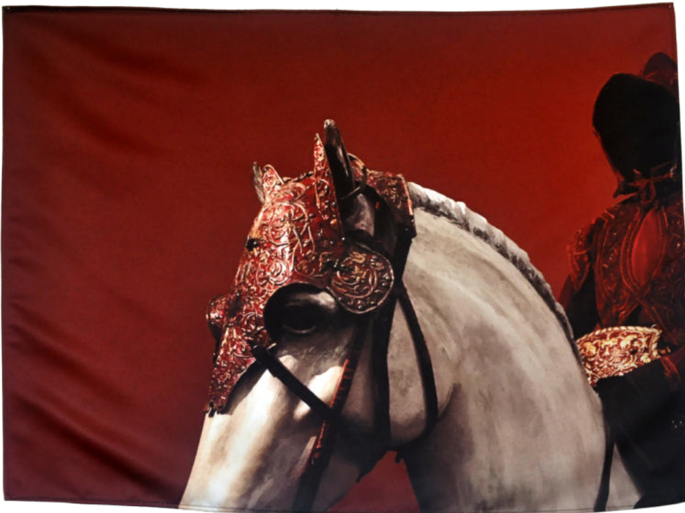
La langue pour parler aux chevaux , Vienna, 2019, Photograph printed on textil, 80/60 cm