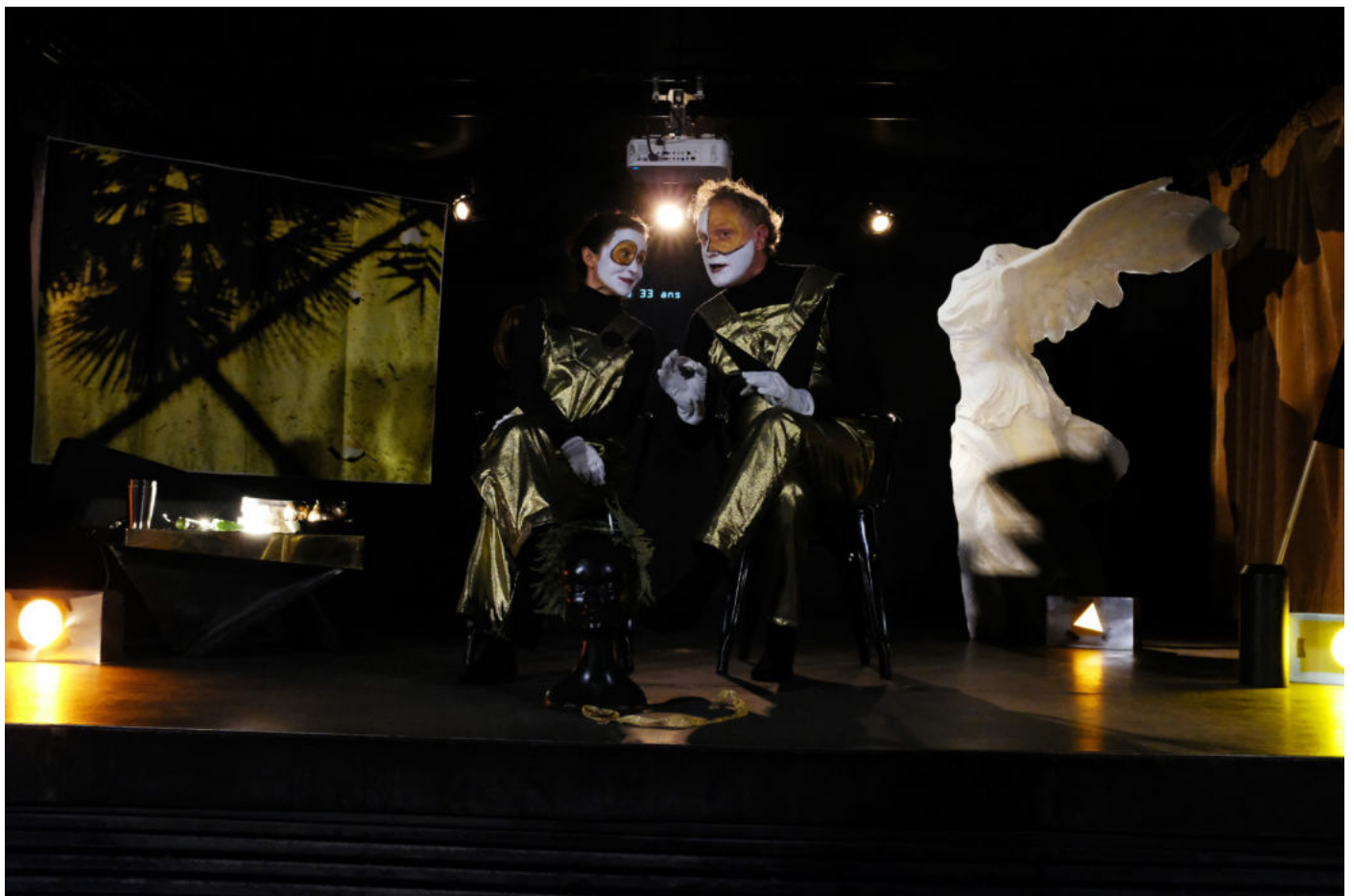
Mythologies de la dette, at Silencio, Paris, Feb 20th.2019