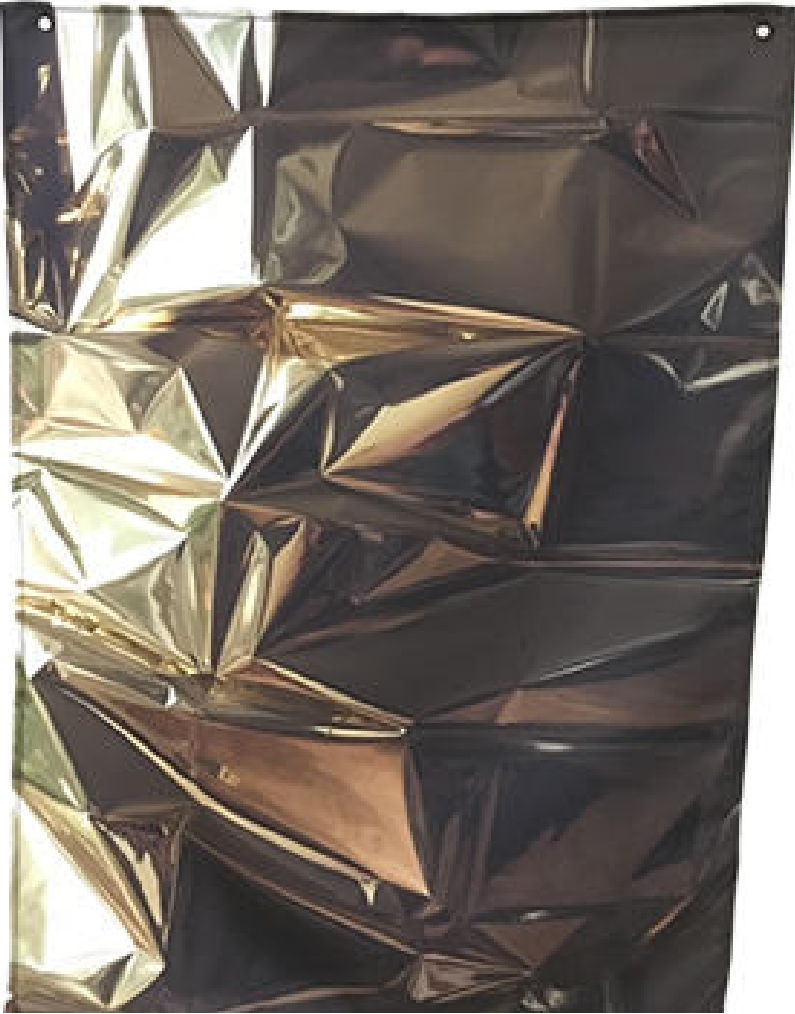
Survie , Paris, 2020, Photograph printed on textil 60/45 cm