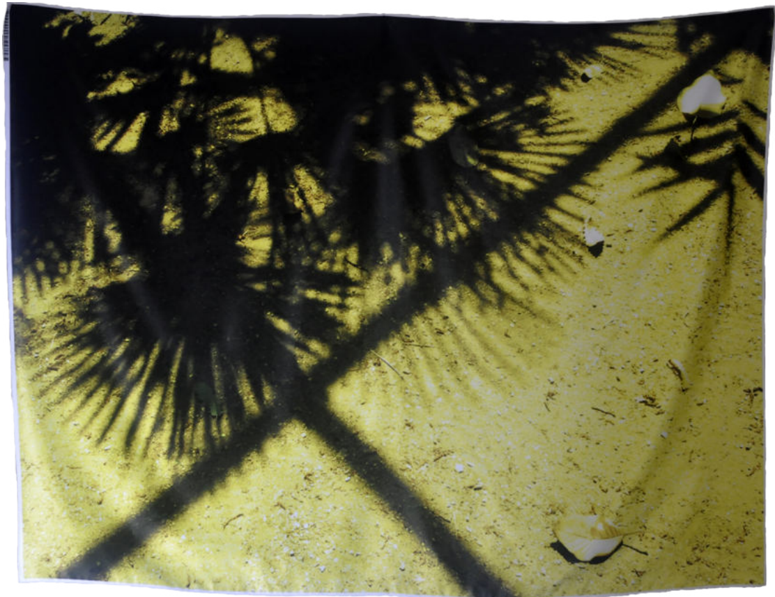
Hier , Paris, 2018, Photograph printed on textil, 120/160 cm