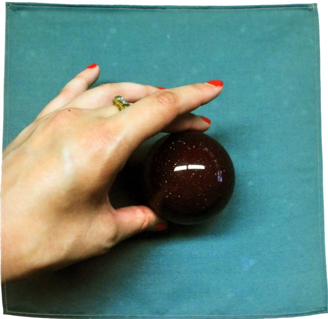
Les règles du jeu, Lyon, 2019 Photograph printed on textile, 40/40cm

This piece consists of a series of 15 photographs printed on textile that revolve around das Schuld-en-Buch . They were taken across France, Austria and Israel. These photographs have been exposed at the Französisches Kulturinstitut, Wien until January 29th.