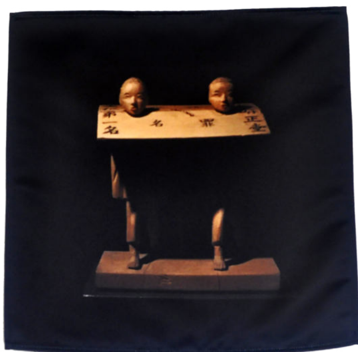
Souvenir , Vienna, 2019, Photograph printed on textil 40/40cm