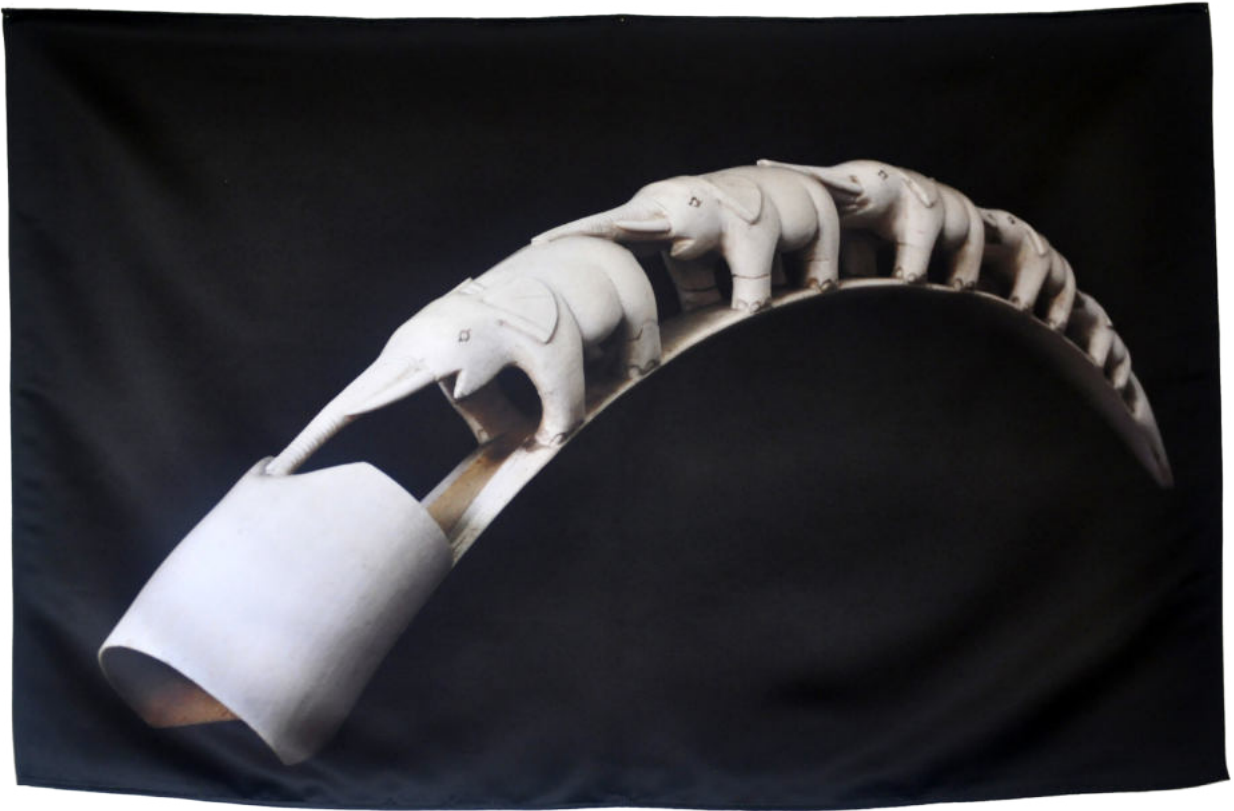
Marseilles , 2019, Photograph printed on textil, 105/70 cm.