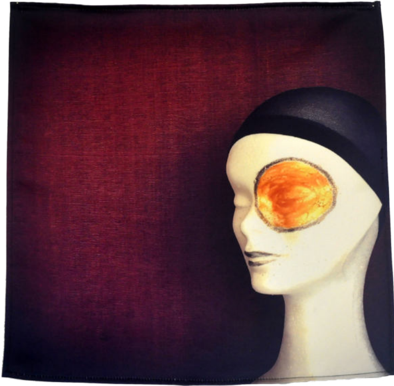
Dieu cercle , Paris, 2017 Photograph printed on textil 40/40cm