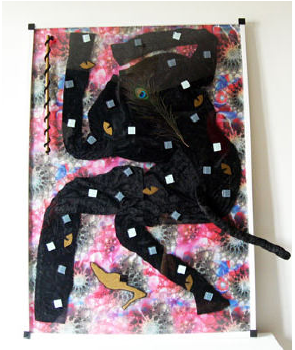
Detail of the installation

From the Olympia of Manet to the one in Der Sandmann by ETA Hoffmann, 5 characters stand for unspoken women voices. The image of a prostitute, the fantasy of an artist's muse, the earth mother or the silent victim of domestic violence, they've been watching and now they're about to speak.