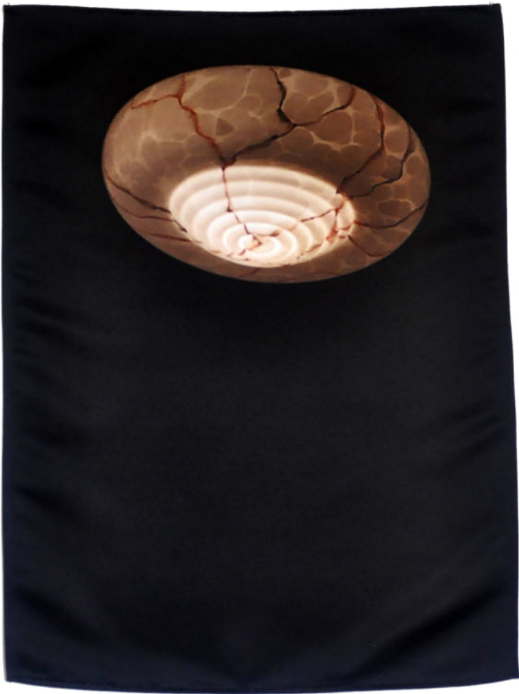
Freundgasse , Vienna, 2019, Photograph printed on textil 60/45 cm