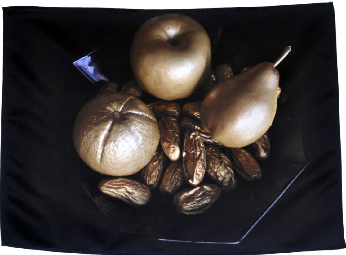
Europa , Paris, 2018 Photograph printed on textil, 60/45 cm.