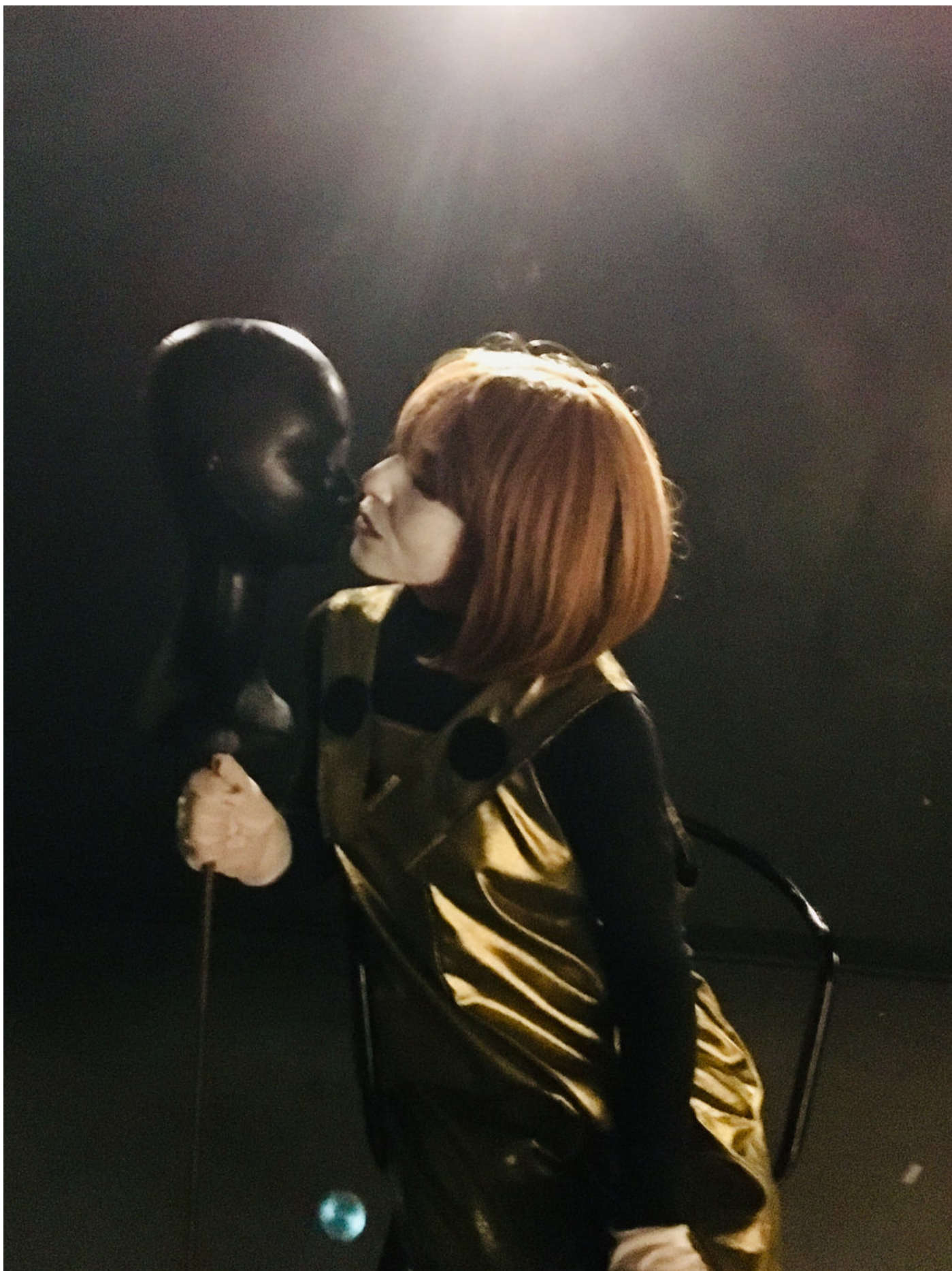
Mythologies de la dette, at Silencio, Paris, Feb 20th.2019