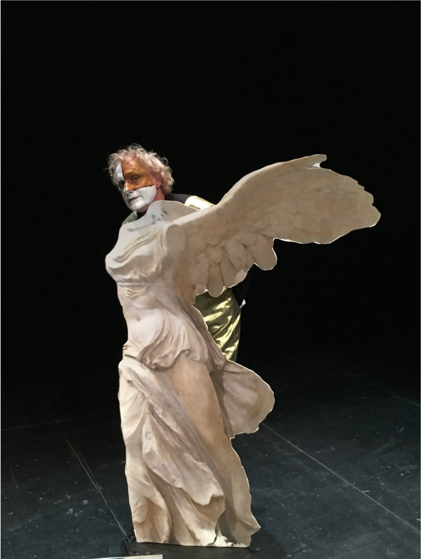
Mythologies de la dette, at TNB, Rennes, Nov 7 th 2018