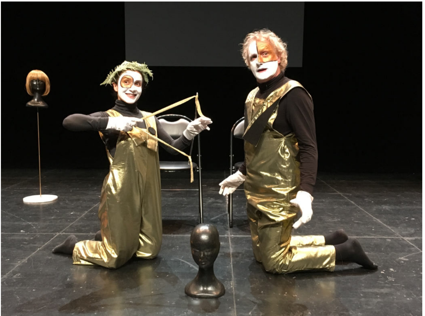
Mythologies de la dette , at TNB, Rennes, Nov 7 th 2018