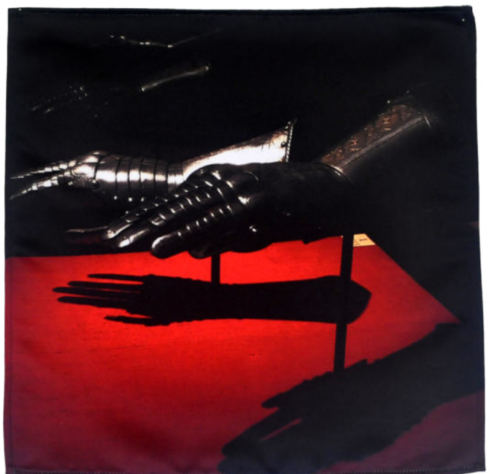
Leopold , Vienna, 2019, Photograph printed on textil 40/40cm