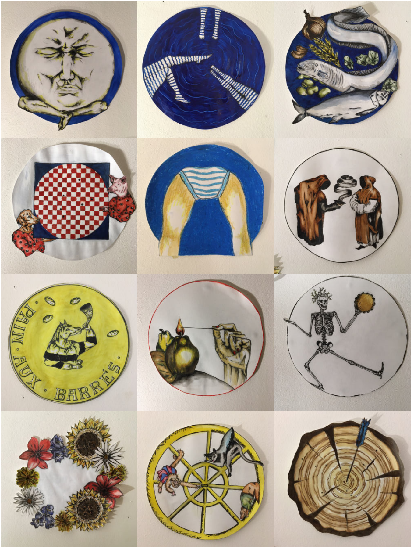
sketches for the ceramics