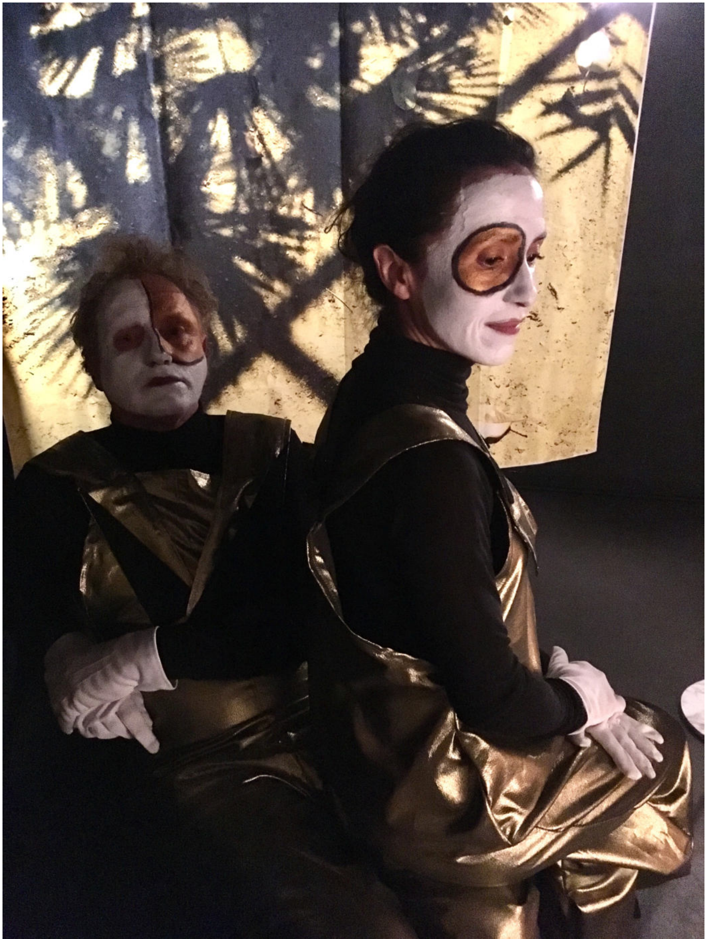
Mythologies de la dette, at Silencio, Paris, Feb 20th.2019