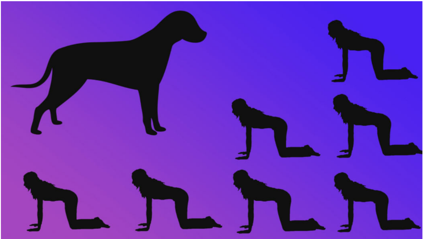
Still from the video Why Dogs Can't Speak