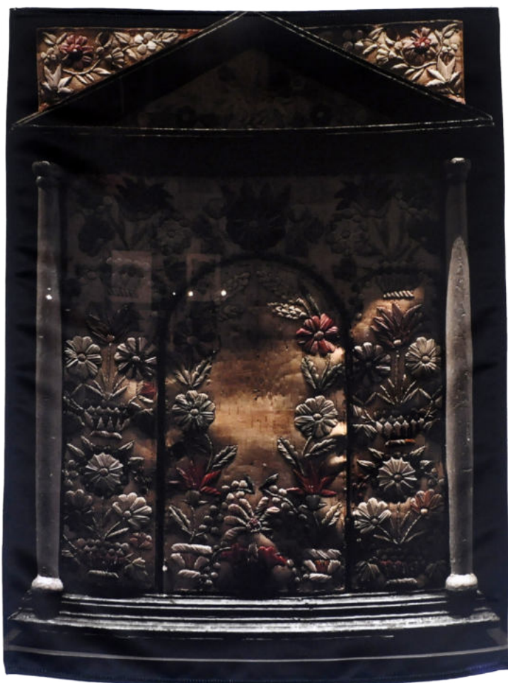
Tabernacle , Vienna, 2019, Photograph printed on textil 60/45 cm